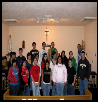
Teens from St. Helen's Parish, Portales visited PDL in October 2008.